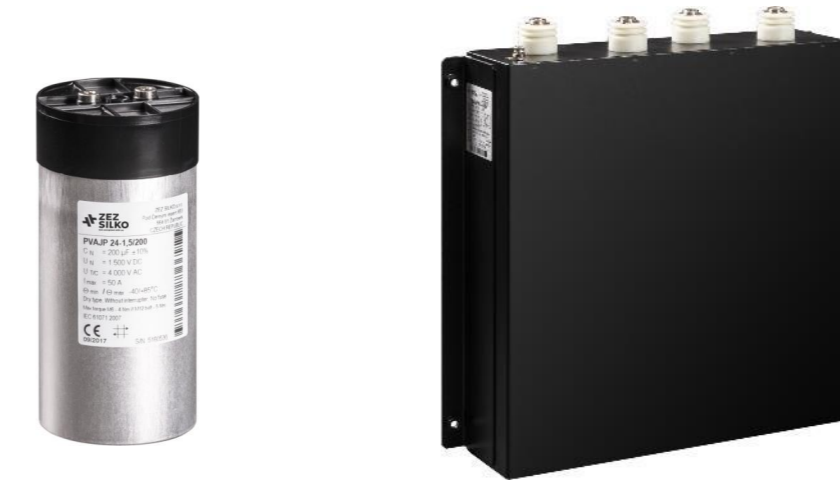
Power Electronics Capacitors