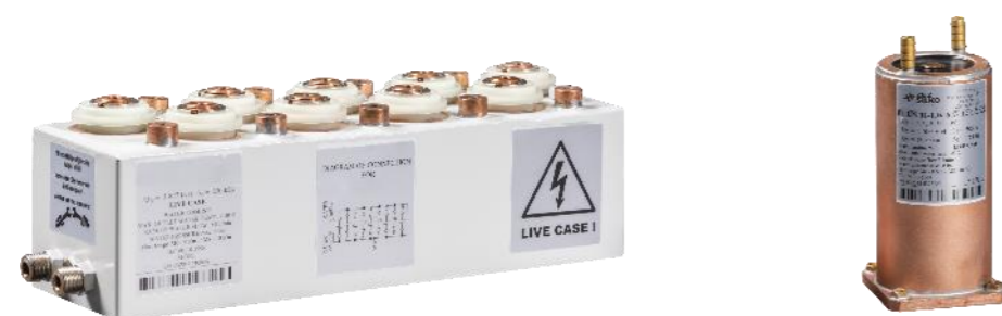
Induction heating caps